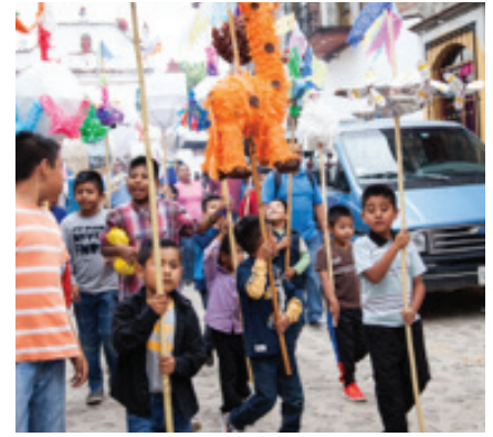
Young boys at a parade