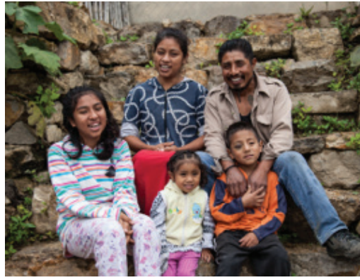
A family picture