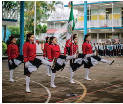
The day begins