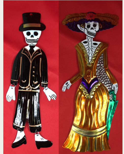
Day of the Dead Artifacts Catrina (right) and her companion. Skeleton artifact are often placed on altars for Día de los Muertos

Traditions and holidays are important in the United States, too. Pick one of these holidays and explain why it is celebrated.